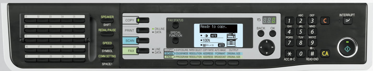
MX-M232D Control Panel.

Maximize capabilities of your MX-M232D with optional full-color network scanning and feature rich network printing! With simple plug-and-play operation, the optional full-featured Network Expansion Kit offers PCL6 and PS3 network printing, walk-up scanning, web-based device management and more. With Sharp's easy-to-use utilities and driver software, the versatile MX-M232D can easily integrate into an existing network environment.