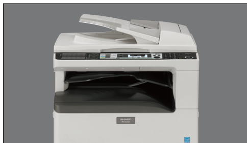
MX-M232D shown with standard 40-sheet Reversing Single Pass Feeder.