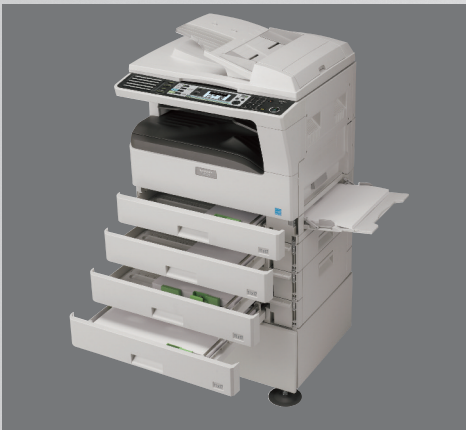
MX-M232D shown with optional 2 x 250-sheet paper feed unit and deluxe low cabinet.